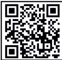
Google Form For Registration